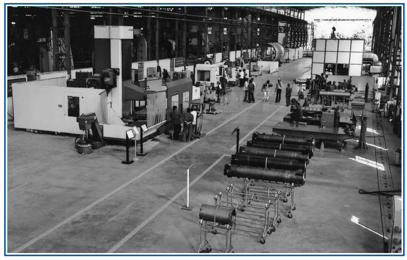
New manufacturing facilities added during the year at Walchandnagar Factory for Aerospace Division.