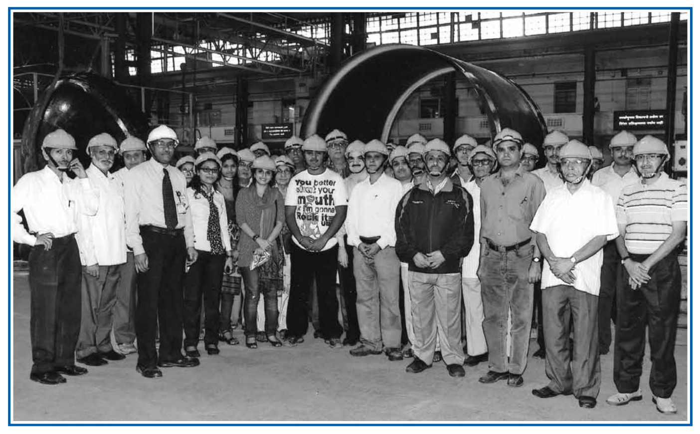
Shareholders' visit to Walchandnagar Factory on 24th December, 2011.